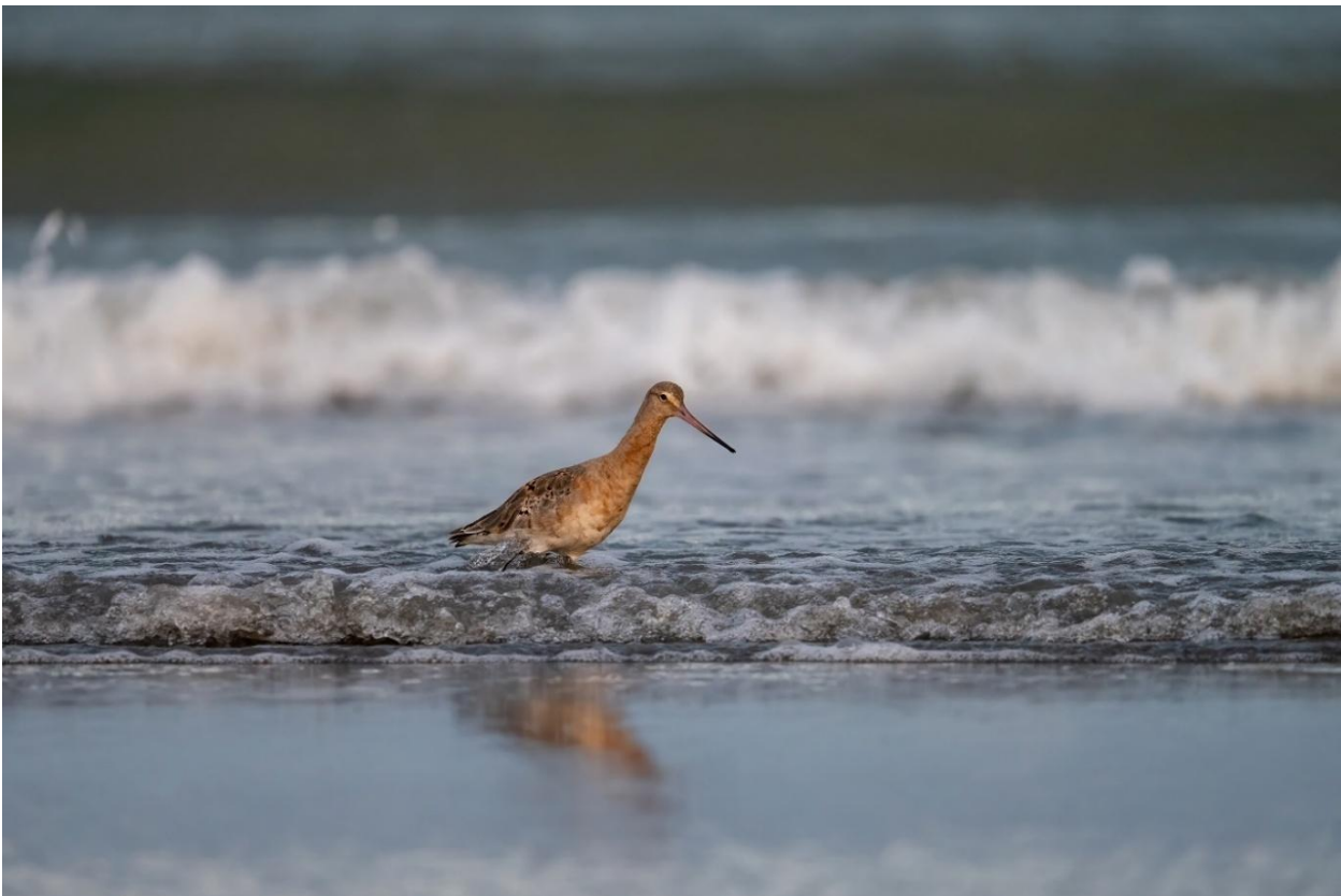
Black-tailed Godwit.

High counts in late July are usually birds returning from their breeding grounds in Iceland.