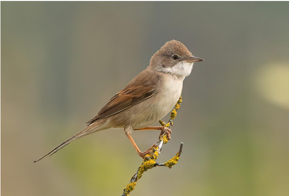
Whitethroat.