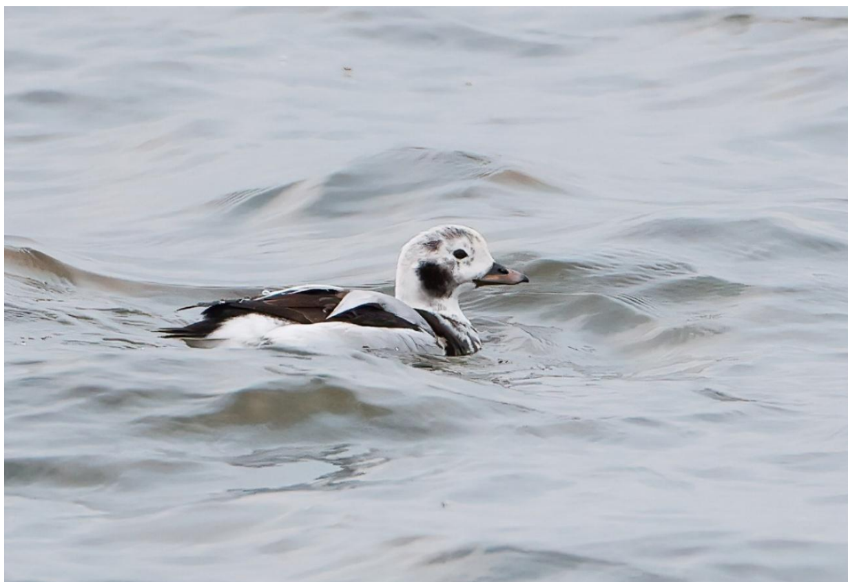
Long-tailed Duck.