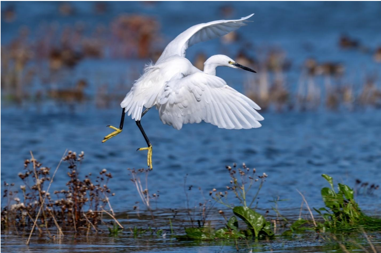
Little Egret (Photo: Philipp Gerasimov).

The highest count was 57 on 17th September (Mark Collins).