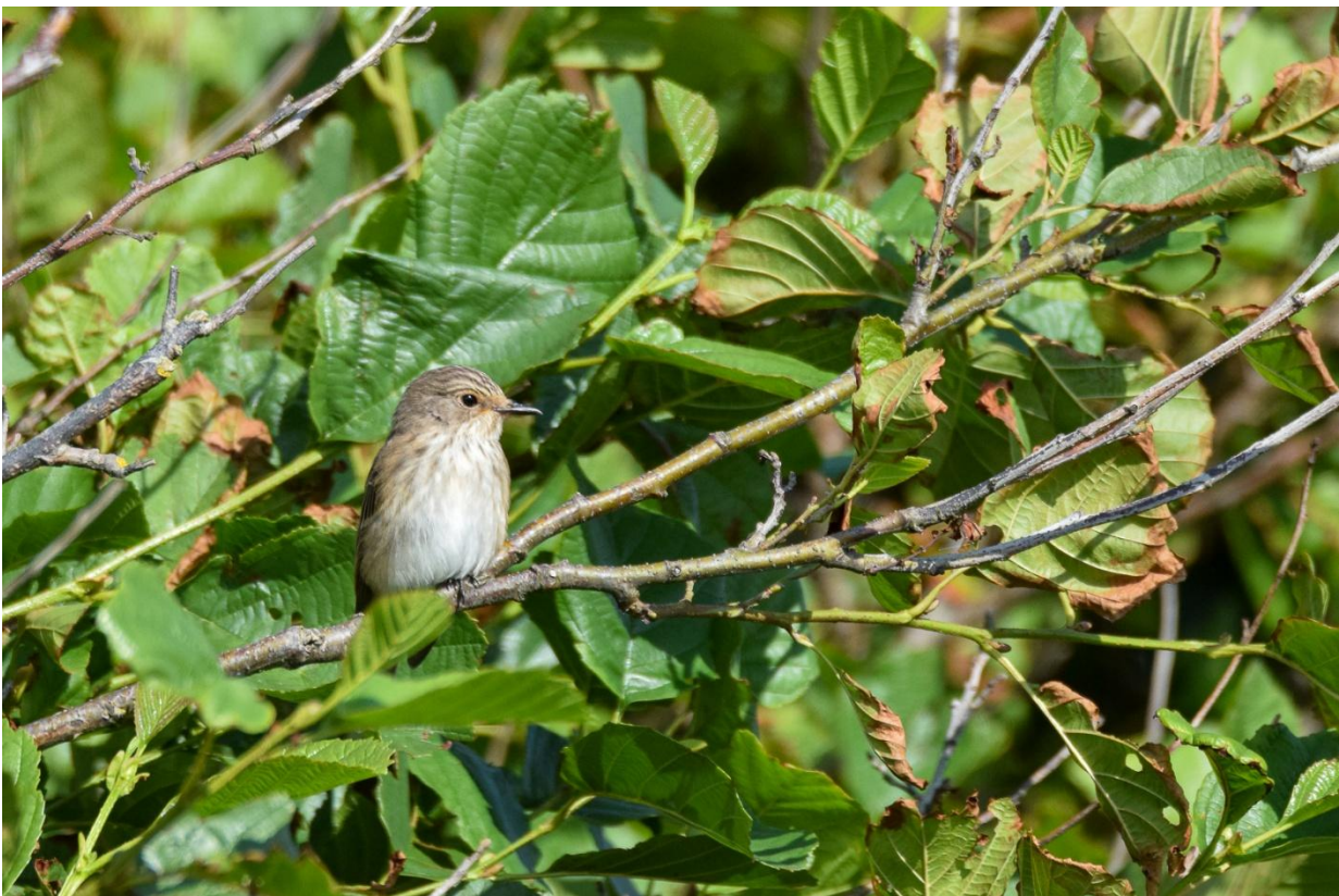
Spotted Flycatcher.

Only one report of a single bird on 24th March (Mahta Mansouri).