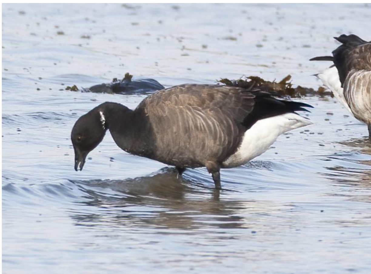
Dark-bellied Brent Goose.