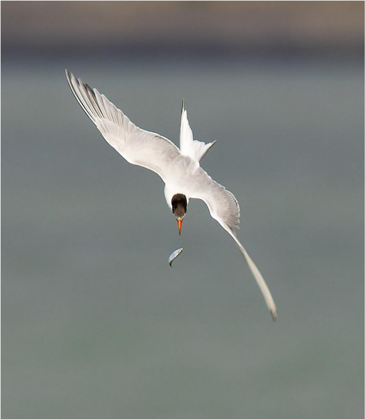
Common Tern.

A very poor year but possibly overlooked.