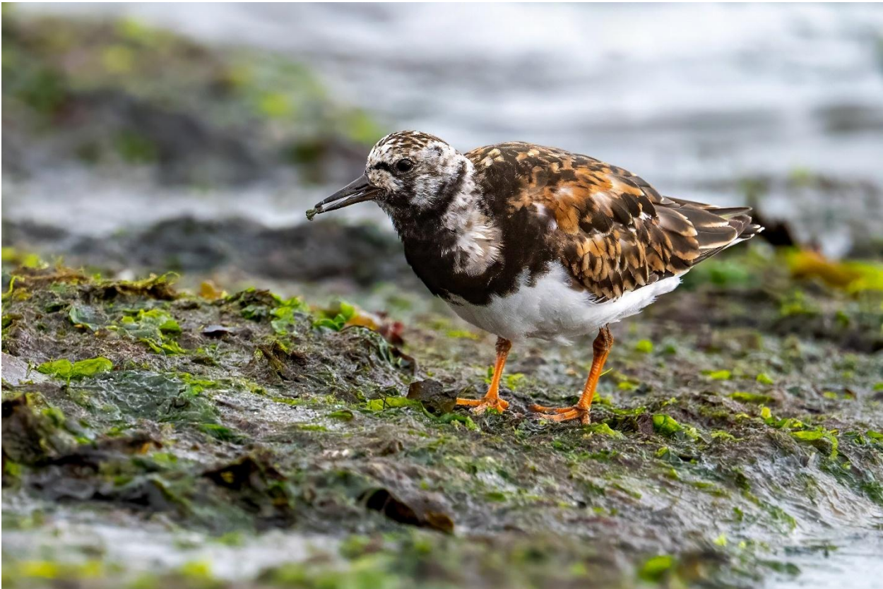
Turnstone.