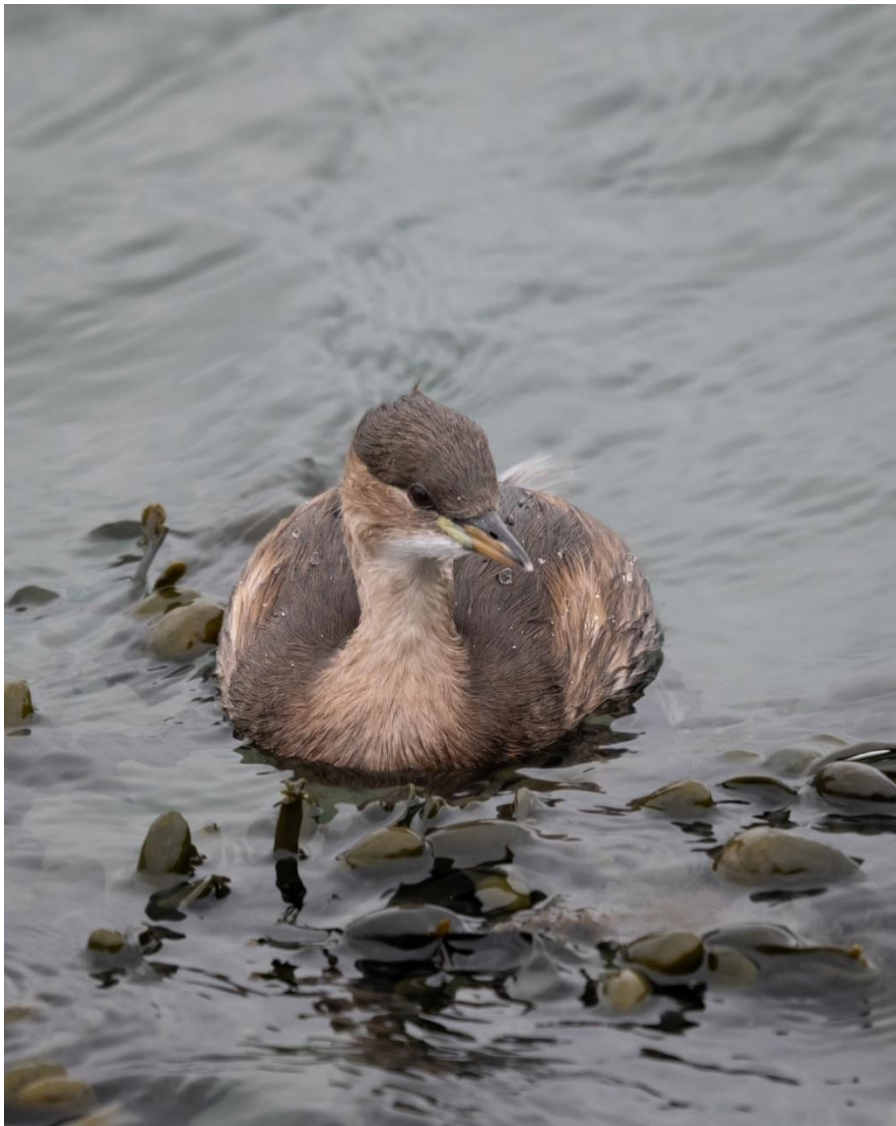
Little Grebe.