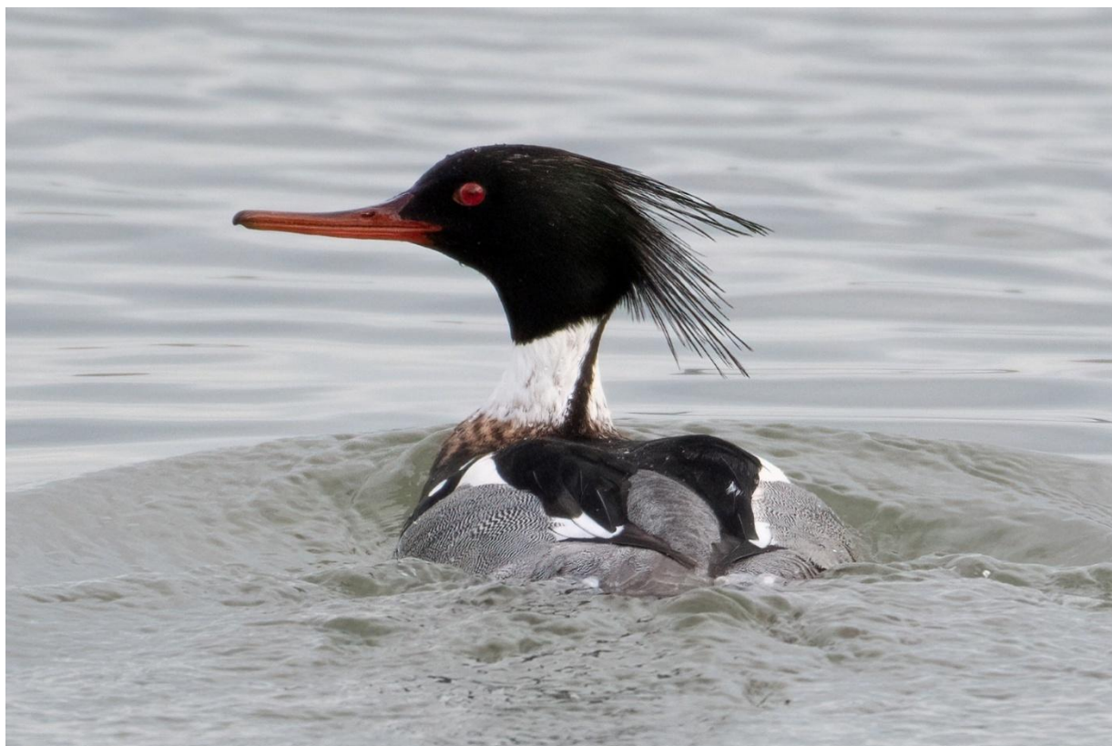
Red-breasted Merganser (Photo: Holly Grogan).

The majority of birds were seen off the Bull Wall or in Sutton Creek but up to seven frequented the south lagoon from January to early April. The November count was large the island.