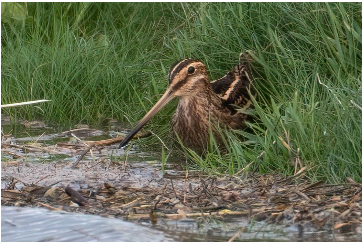
Common Snipe.

Small numbers reported from various locations but mostly from the Bull Wall Reed Marsh. Although Snipe overwinter on the island, it is also a stopover site for passage migrants. A bird fitted with a satellite tracker in Normandy (France) on 18th April 2024, left that location on 5th May and one day later was at the Bull Wall Reed Marsh. It remained on the south end of the island for less than 24 hours and departed early on the 7th May. It then spent several days in Mayo before the transmitted failed on the 15th May.