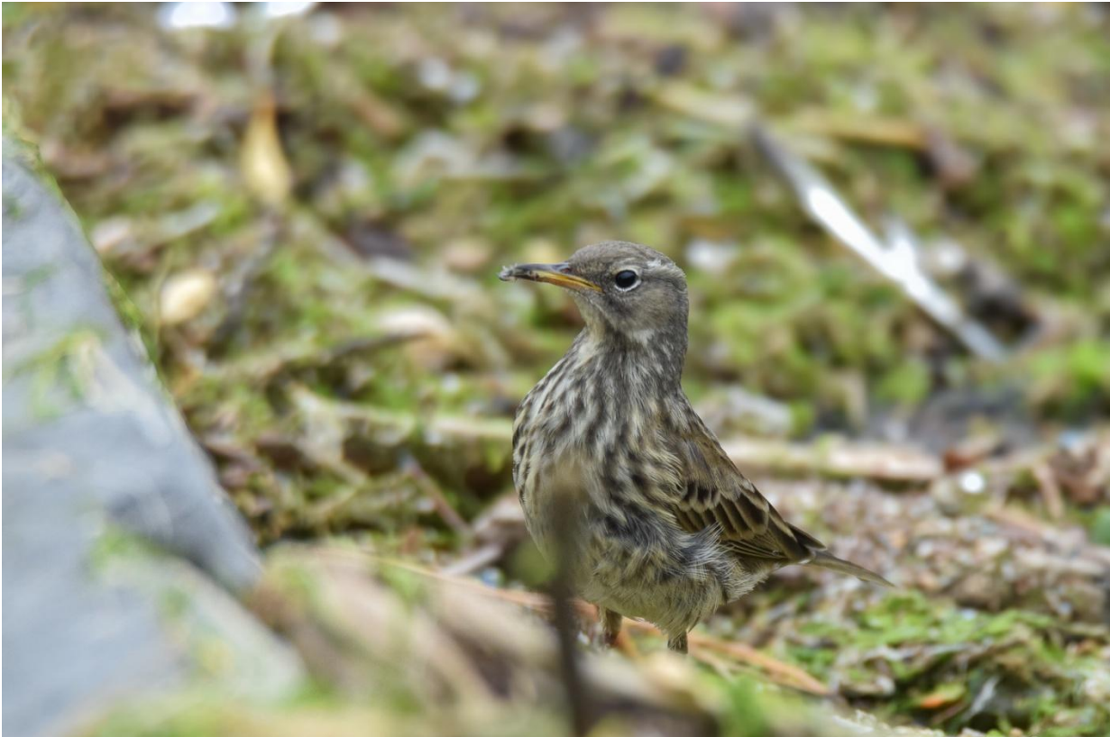
Rock Pipit.

There was a notable increase in the number of Rock Pipits reported in 2024. Birds were recorded in March, July and each month from August to December from various locations around the island. Single birds were seen on most occasions but two were present on 26th August, 5th September and 14th November.