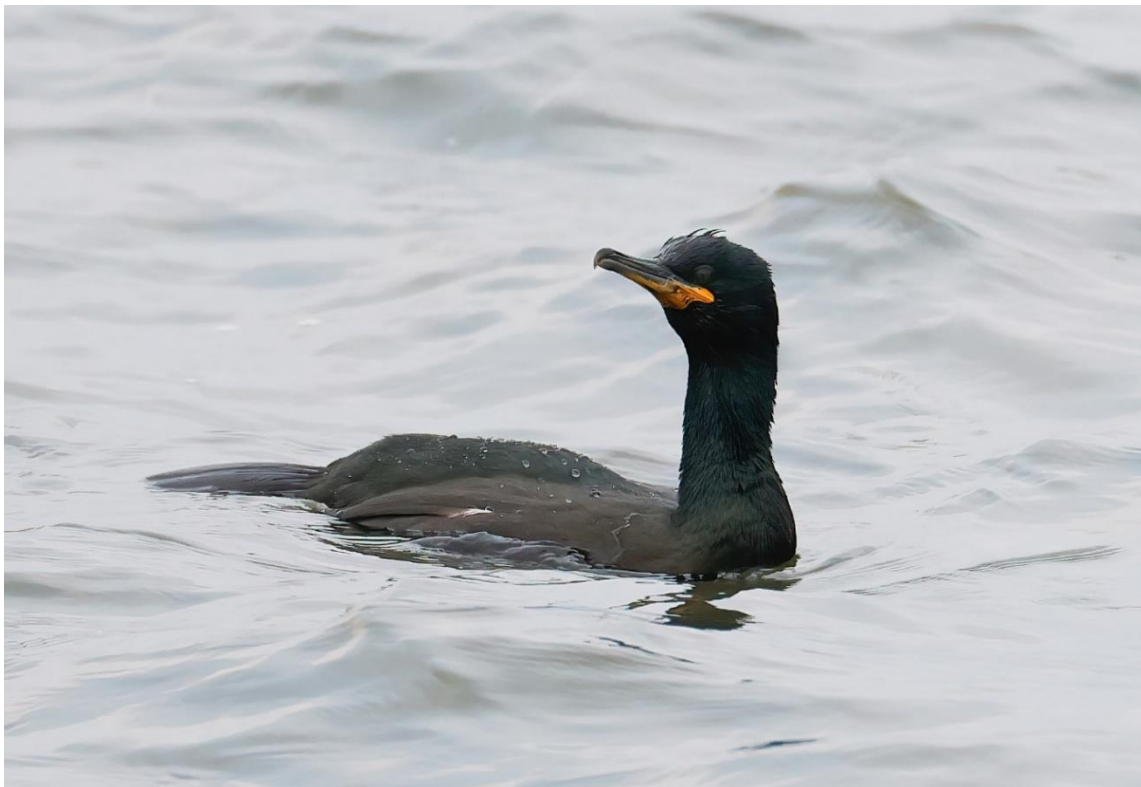
Shag.