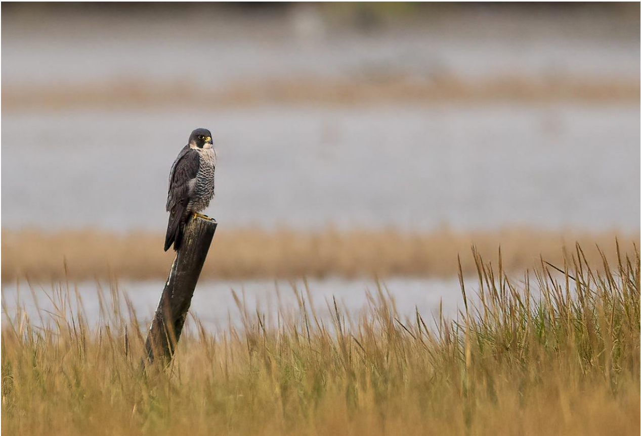
Peregrine.

Single birds on many dates from January to 9th April and again from 9th July to the end of the year. Two were reported in January, March, October and December.